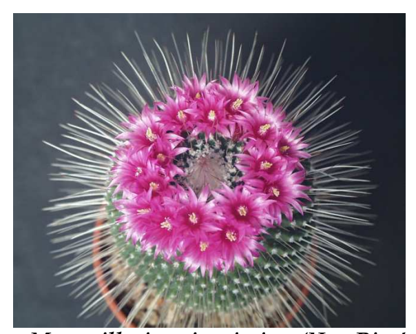
Mammillaria spinosissima 'Uno Pico'