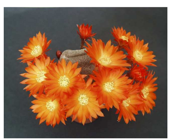
Crested Rebutia heliosa